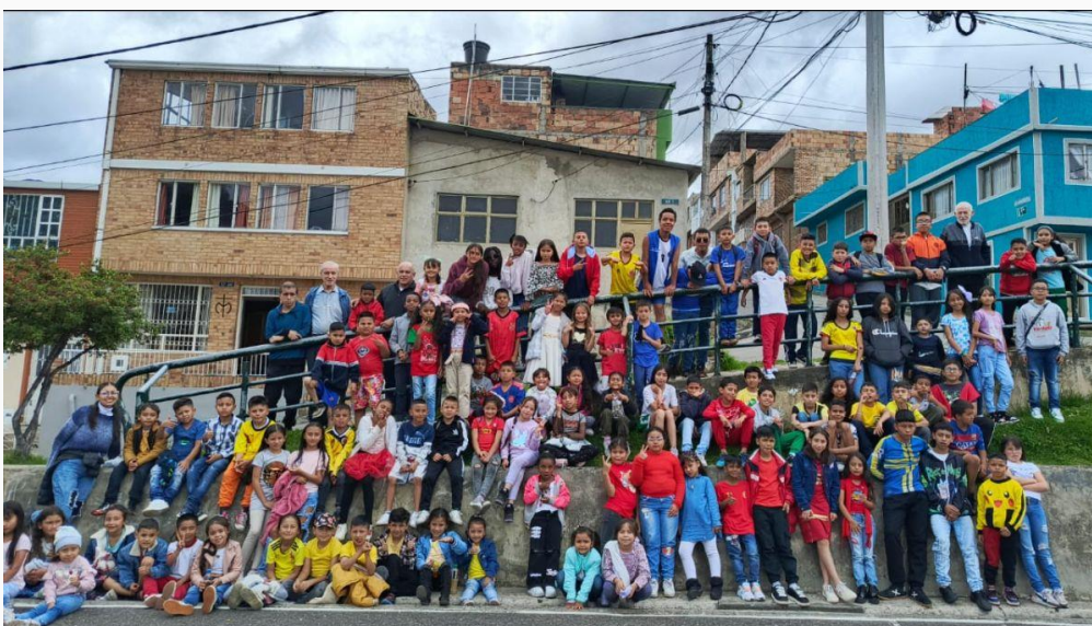
Bogota, Children from the school support centers and brothers in front of the community of the Blessed Chaminade parish.

The Marianist Family is well represented in Colombia as well as in Ecuador, by a strong presence of Marianist Lay Communities and Marianist sisters. There is an opportunity for everyone.